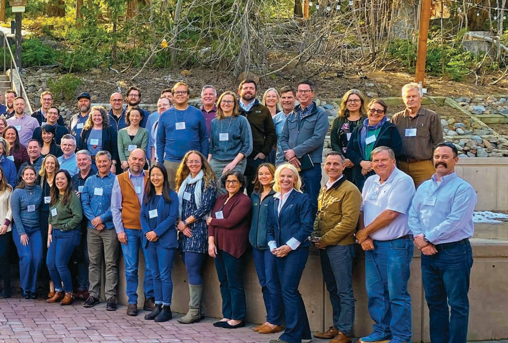
Attendees at the 2024 Wildfire Resilience Initiative Grantee Convening at Granlibakken Tahoe.