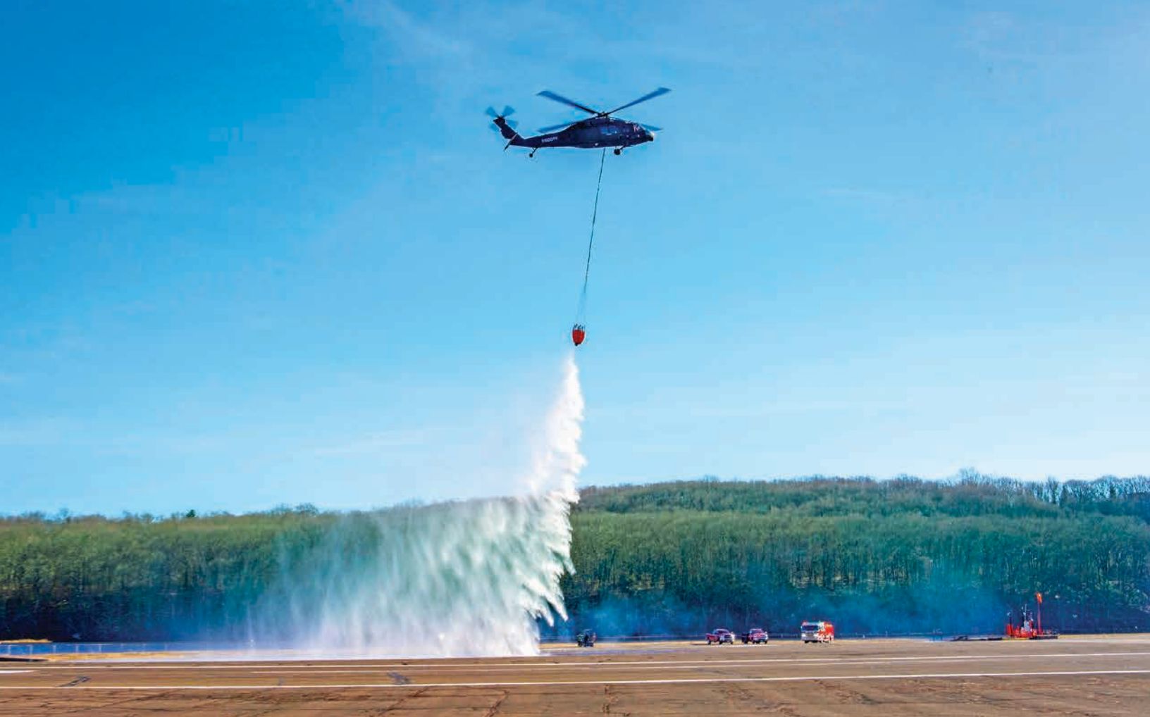
Lockheed Martin – Sikorsky autonomous Black Haw equipped with Rain software for dispatch, remote supervision, fire localization, and suppression targeting flies over a fire set behind Sikorsky HQ in Connecticut for testing.