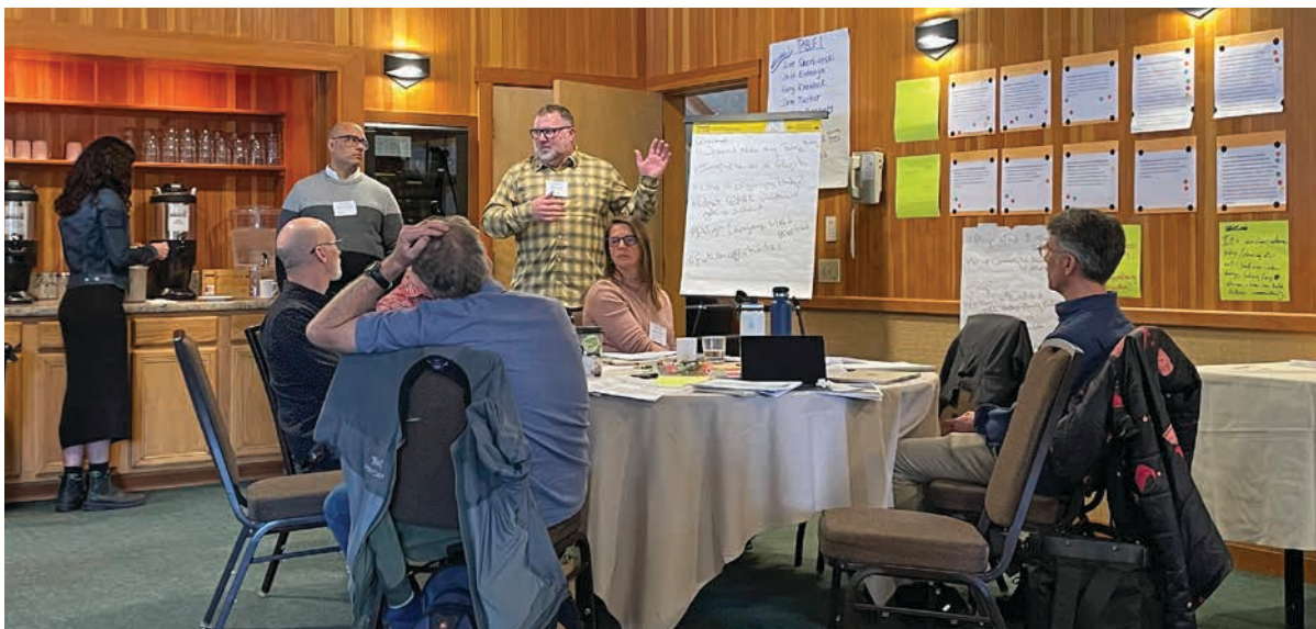
SPARK grantees at the 2024 Wildfire Resilience Initiative Grantee Convening at Granlibakken Tahoe.

The SPARK grantees have also identified opportunities associated with their place-based work, many of which directly address the challenges outlined above: (1) the chance to build capacity with a wide array of stakeholders, (2) facilitation of science-based input into the creation or revision of local or statewide fire management plans, (3) integration of technology to support early-fire interventions, prioritized mitigations, fire pathway disruptions and land-use planning decisions, (4) a ripe environment for cultural shift and building momentum in the wildfire space, and (5) opportunities to develop and implement sustainable and long term solutions toward wildfire resilience. Finally, and perhaps most importantly, each SPARK pilot provides an opportunity for (6) current and future grantees to connect and leverage their work where research or development can be translated into “real-world” applications that can benefit the SPARK projects, and the communities and ecosystems they are supporting.