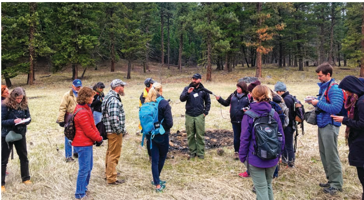
Journalists learn about fuel reduction during a training program with the Institute for Journalism & Natural Resources. Suggested (Photo: Dave Spratt)

Other alignment projects include supporting development of a Wildfire Resilience Funders network that now numbers more than 75 funding organizations participating in online and in-person meetings, developing action groups around topics of shared concern, and identifying opportunities to improve alignment and maximize impact. Conversa Corps has built a searchable 8,000-member wildfire community member database called the “Aid Arena” and curated communications via Slack to connect new groups. The Institutes for Journalism for Natural Resources convened journalists to experience the wildfire challenge through a week-long field trip, curating speakers to illustrate the nuance and complexity of wildfire management.