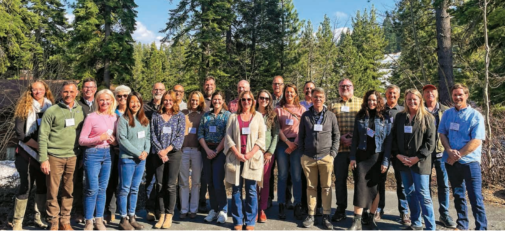
Wildfire Resilience Initiative Select Pilots to Achieve Resilience by Key Indicators (SPARK) grantees at the 2024 Wildfire Resilience Initiative Grantee Convening at Granlibakken Tahoe.