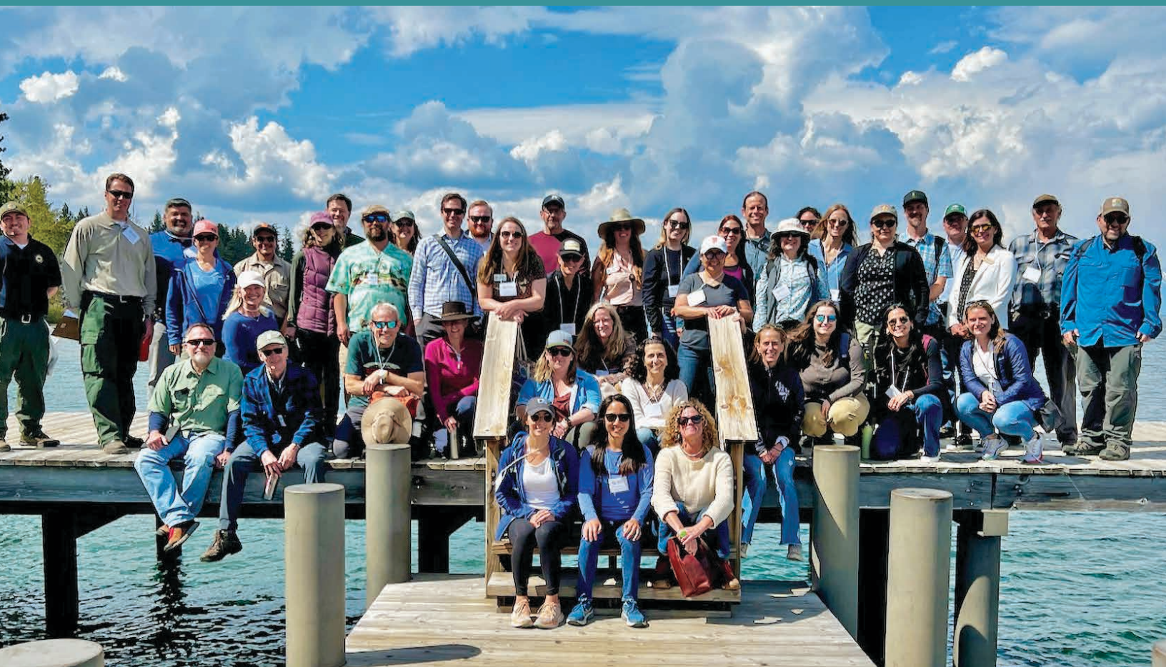
Wildfire Resilience Funders Network annual convening at Lake Tahoe, May 2023.