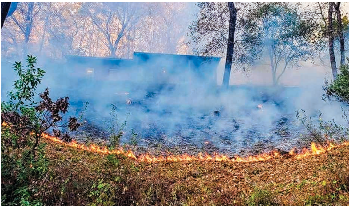
A home protection burn.